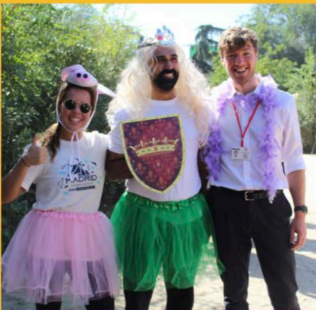
Staff Sponsored Run