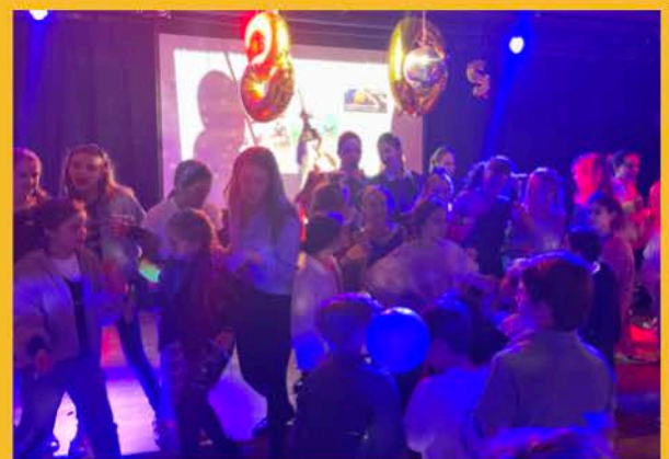
Prep School Disco